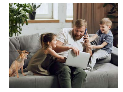
Limit background noise and distractions.