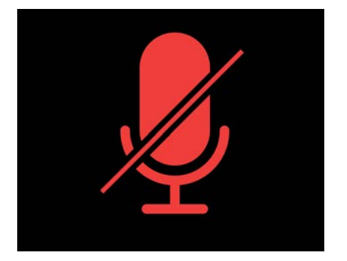
Mute your mic when you aren't speaking.