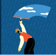
Illustration of Potential Impacts to Paid Casemix from Coding and Documentation Improvement